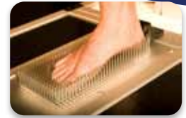
TRUE 3D FOOT SCAN

myFootDr™ uses soft, full-length, CAD/CAM orthotics made from durable, cushioned rubber. Instantly comfortable and ready in one hour*.